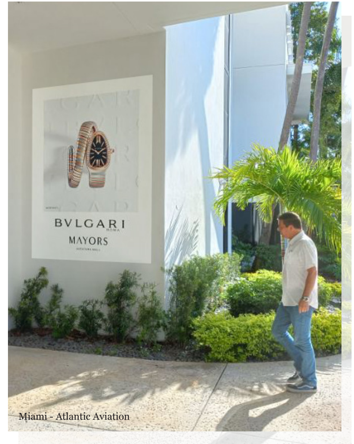
Miami - Atlantic Aviation